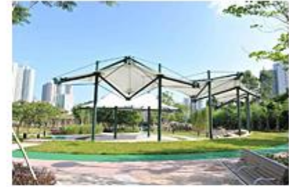
Tai Chi Garden