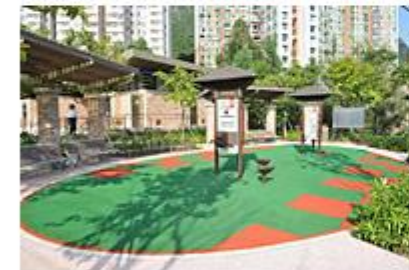
Elderly Fitness Corner